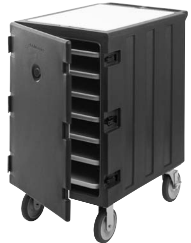
1826LTC3 (For Trays & Sheet Pans)